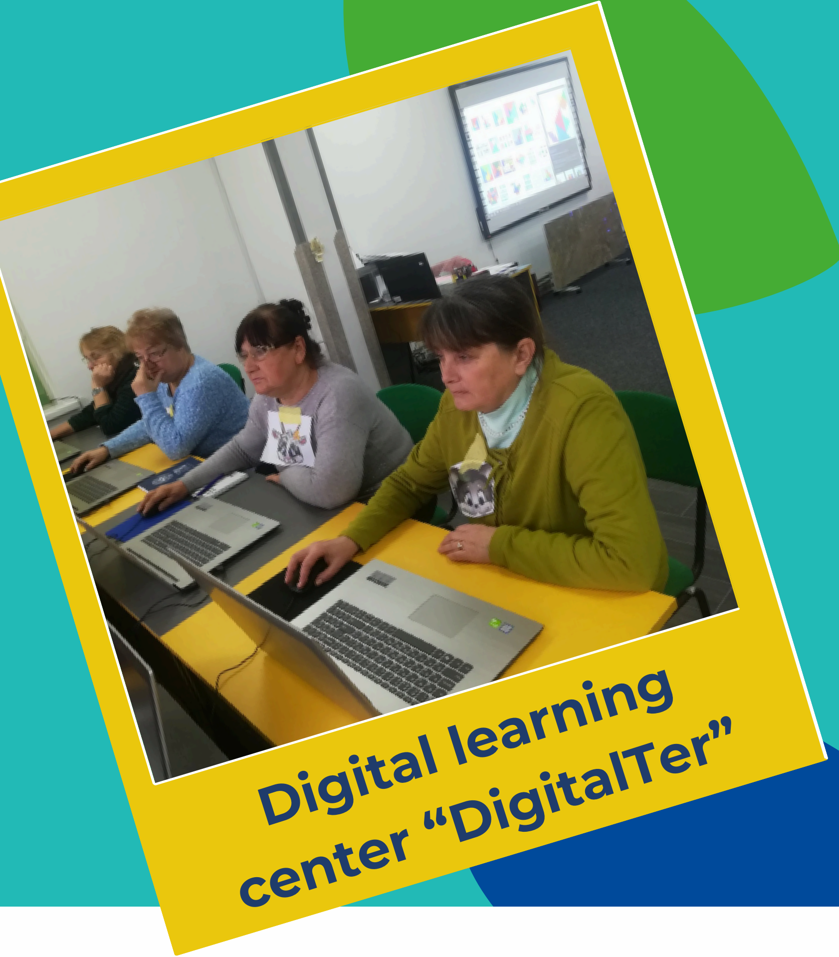
Digital learning center "DigitalTer"

The "DigitalTer" project contributes to the digitalization of the Terebovlia community.